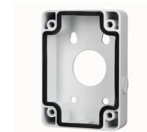
PFA120 Junction Box