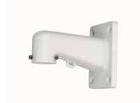
PFB305W Wall Mount Bracket